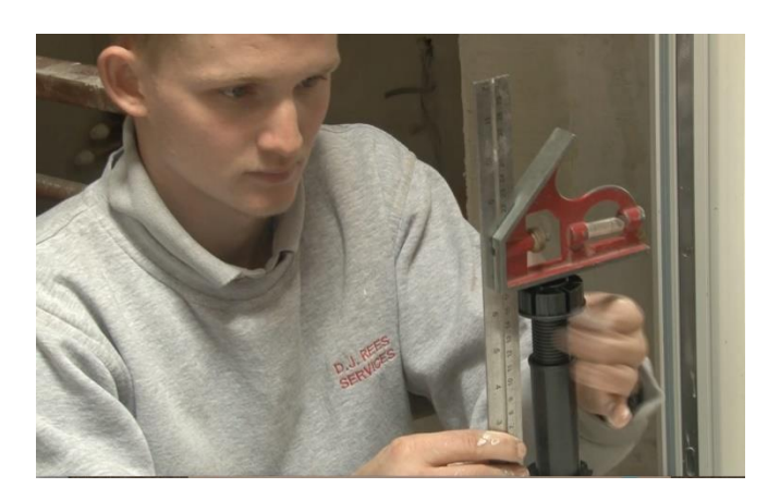
D.J. Rees have recruited apprentices from the Veterans Employment Pathway Scheme

If all the employers our size in Wales got involved, that would add up to a lot of firms taking on a lot of military talent altogether.